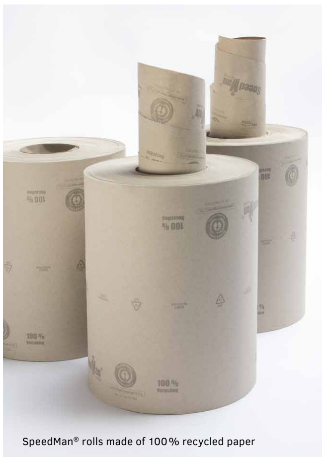
SpeedMan® rolls made of 100% recycled paper