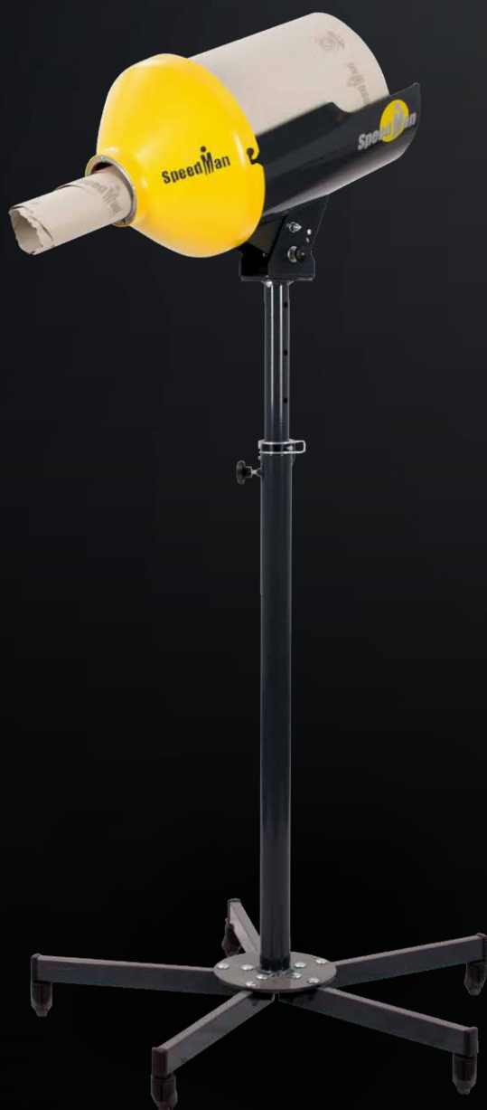
SpeedMan® Classic with roll frame