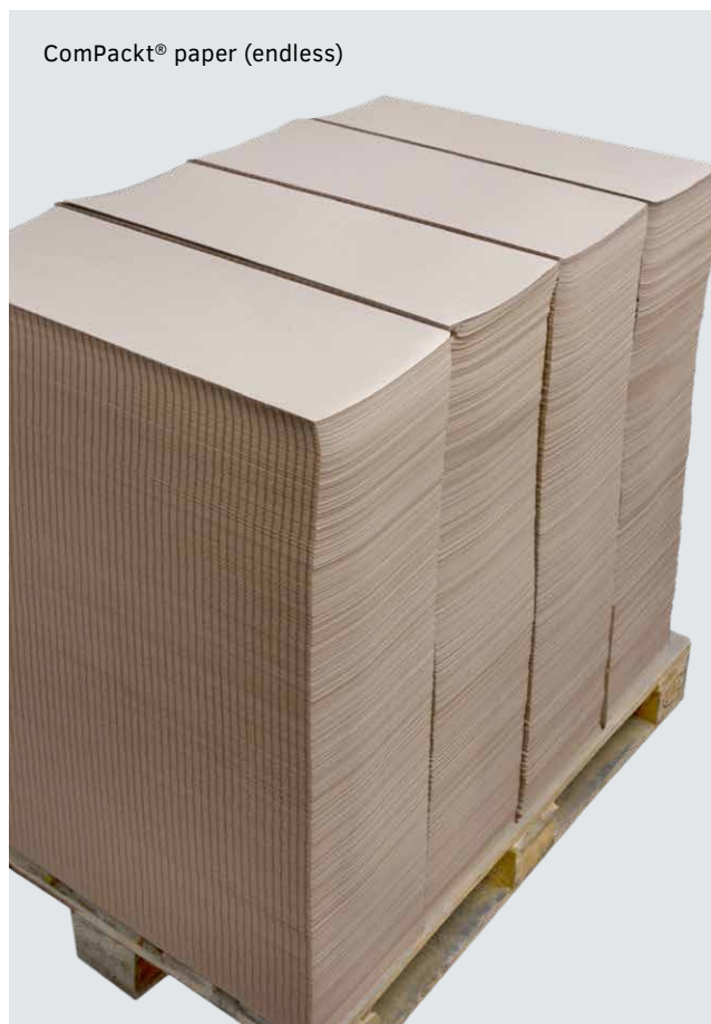
ComPackt® paper (endless)