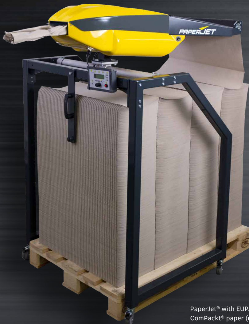
PaperJet® with EUPAL frame and ComPackt® paper (endless)